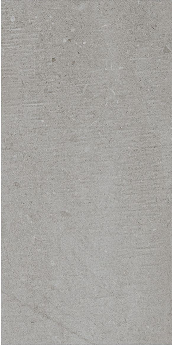
60 x 120 cm (24 x 48) BC.UT.HMT.2448.MT