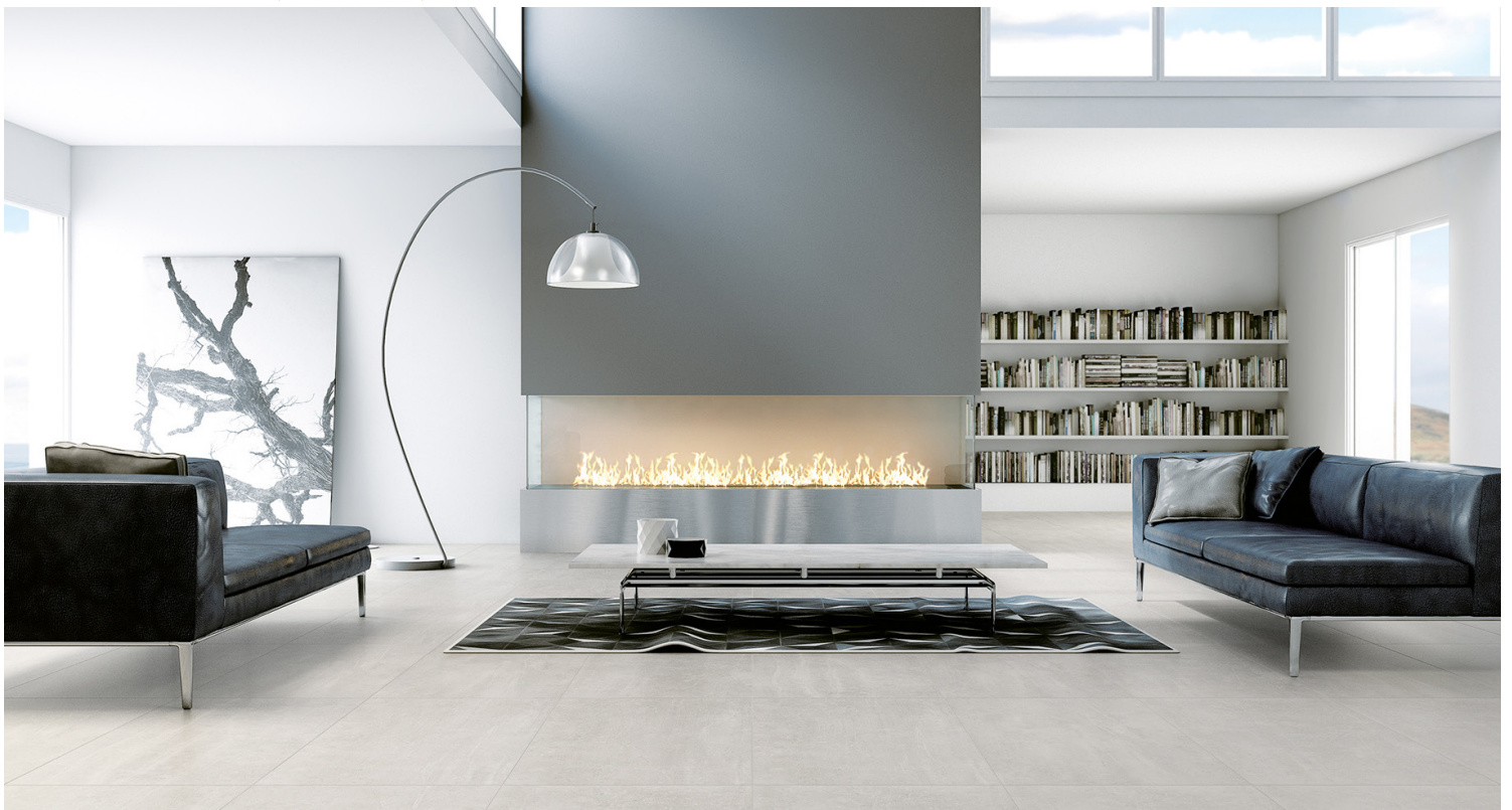
MANHATTAN (LIGHT GREY)