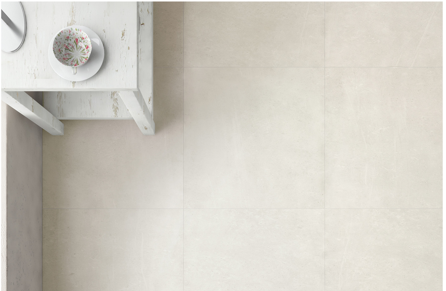
SUGAR HILL (WHITE)