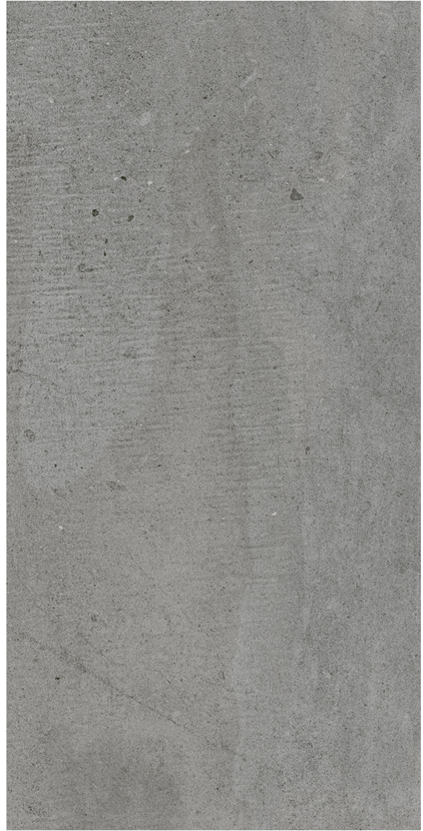
60 x 120 cm (24 x 48) BC.UT.WSG.2448.MT

All items shown in this document are part of Olympia's stocking program. For special orders, please contact your Olympia Tile Sales Representative.