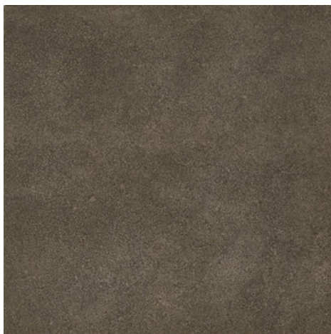
VOGUE BROWN CC69