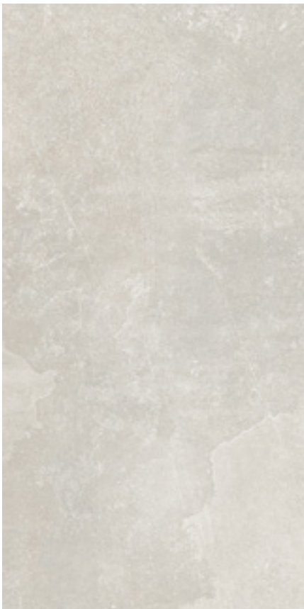
30 x 60 cm (11.82" x 23.63") EX.LP.BGE.1224.MT