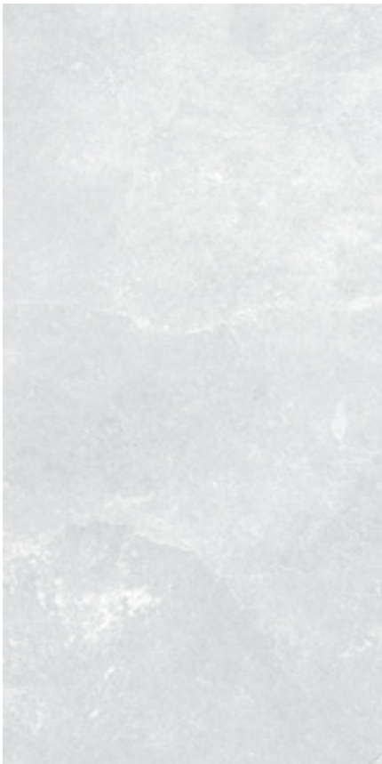
30 x 60 cm (11.82" x 23.63") EX.LP.WHT.1224.MT