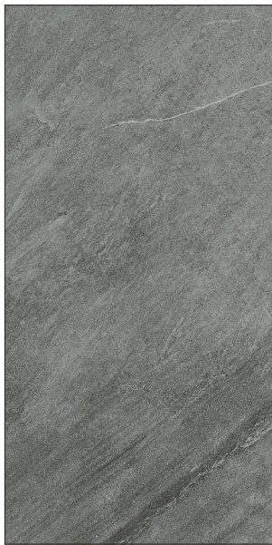
30 x 60 cm (12 x 24) OE.PS.GRU.1224.MT