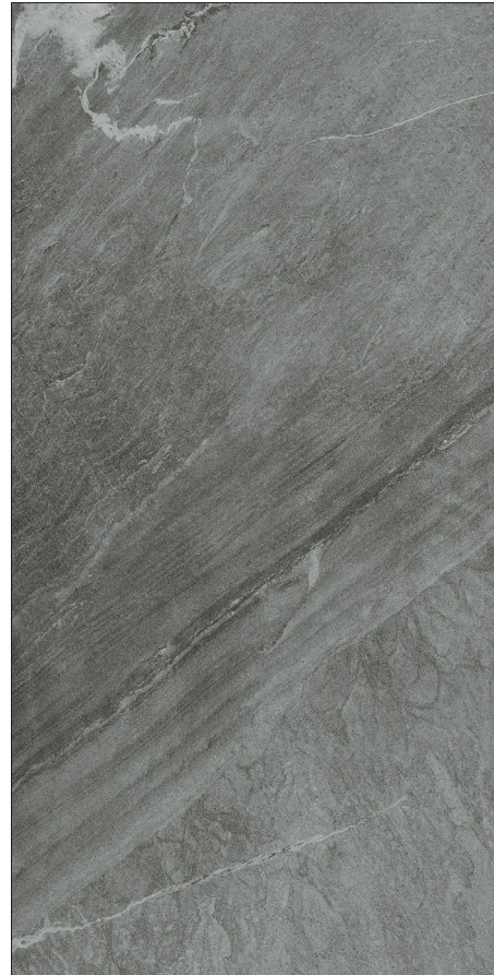
45 x 90 cm (18 x 36) OE.PS.GRU.1836.MT

All items shown in this document are part of Olympia's stocking program. For special orders, please contact your Olympia Tile Sales Representative.