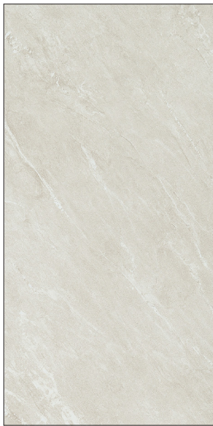
30 x 60 cm (12 x 24) OE.PS.CRD.1224.MT