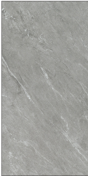
30 x 60 cm (12 x 24) OE.PS.GRC.1224.MT