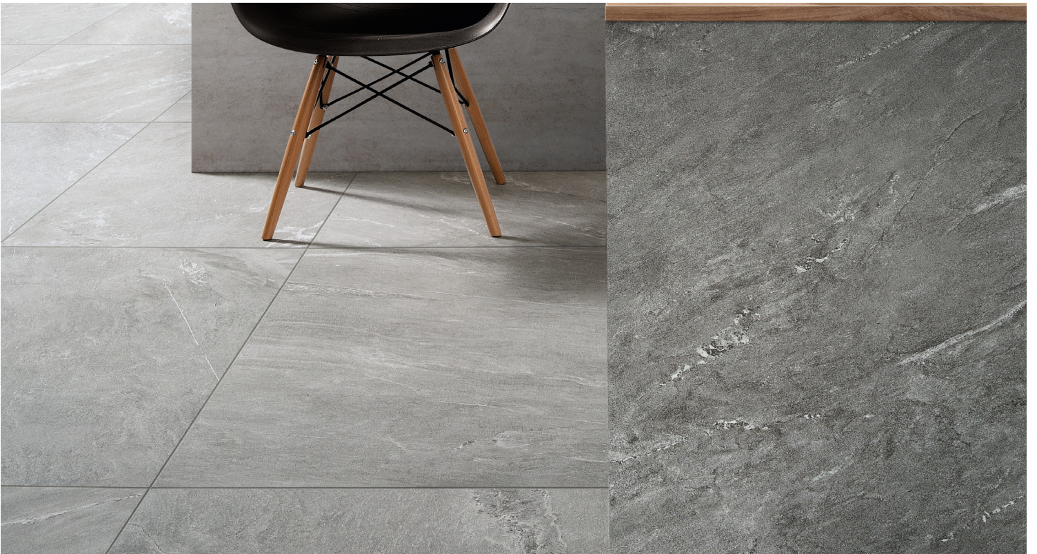
GRIGIO SCURO (Dark Grey)