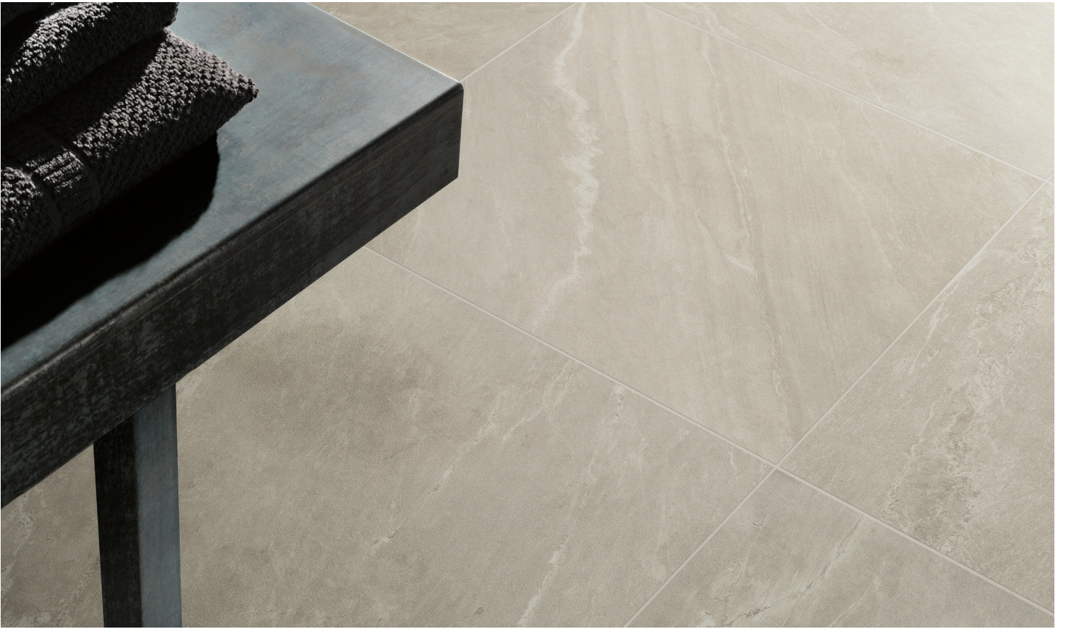
CORDA (Off White)