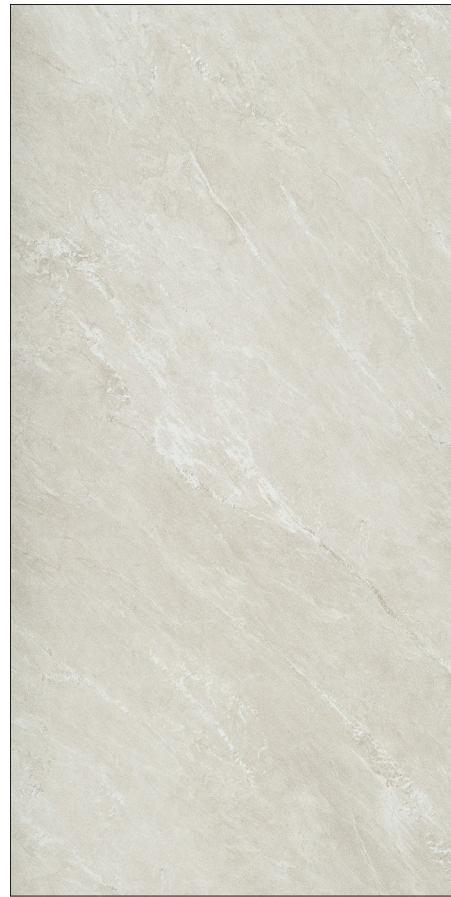
45 x 90 cm (18 x 36) OE.PS.CRD.1836.MT

All items shown in this document are part of Olympia's stocking program. For special orders, please contact your Olympia Tile Sales Representative.