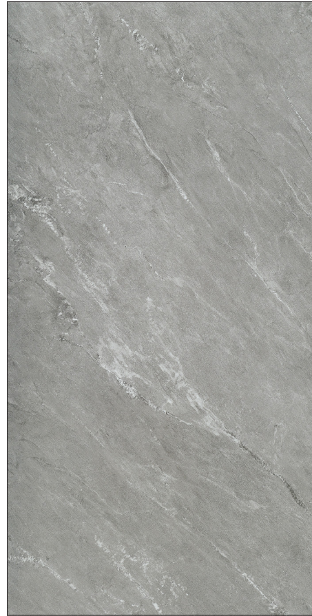
45 x 90 cm (18 x 36) OE.PS.GRC.1836.MT

All items shown in this document are part of Olympia's stocking program. For special orders, please contact your Olympia Tile Sales Representative.