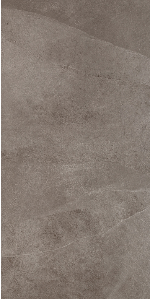
75 x 150 cm (30 x 60) MZ.MY.CNR.3060

All items shown in this document are part of Olympia's stocking program. For special orders, please contact your Olympia Tile Sales Representative.