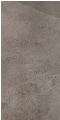
30 x 60 cm (12 x 24) MZ.MY.CNR.1224