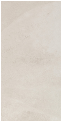
30 x 60 cm (12 x 24) MZ.MY.BIA.1224