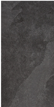
30 x 60 cm (12 x 24) MZ.MY.ATR.1224