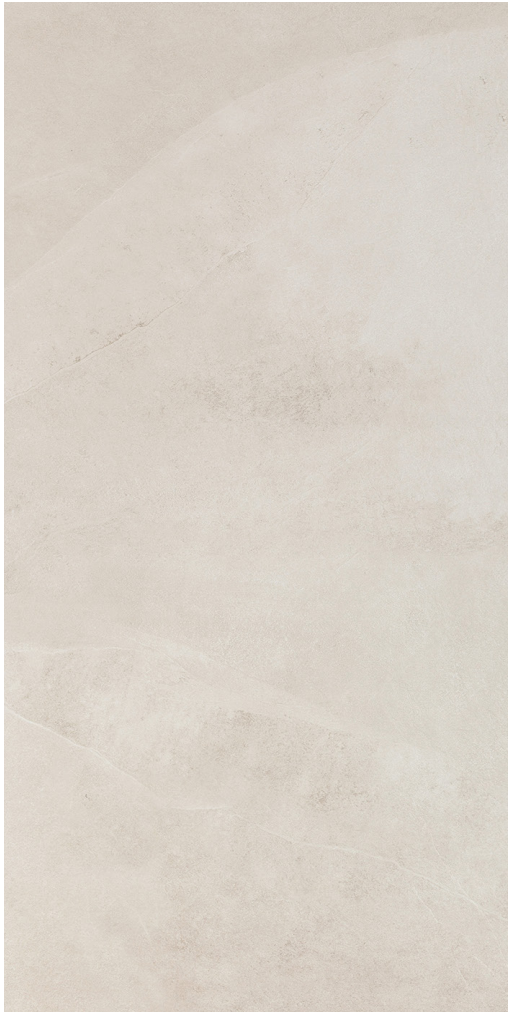
75 x 150 cm (30 x 60) MZ.MY.BIA.3060

All items shown in this document are part of Olympia's stocking program. For special orders, please contact your Olympia Tile Sales Representative.