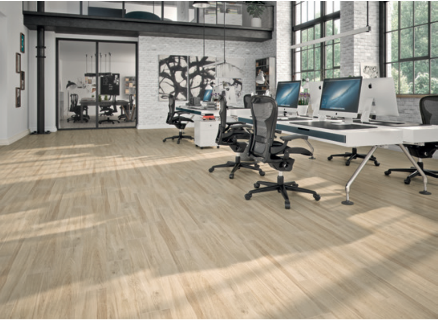
Natural (Light Beige)