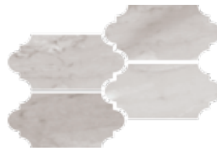
6000399 - PROVENZALE 9,5X20/3,8"x7,9"