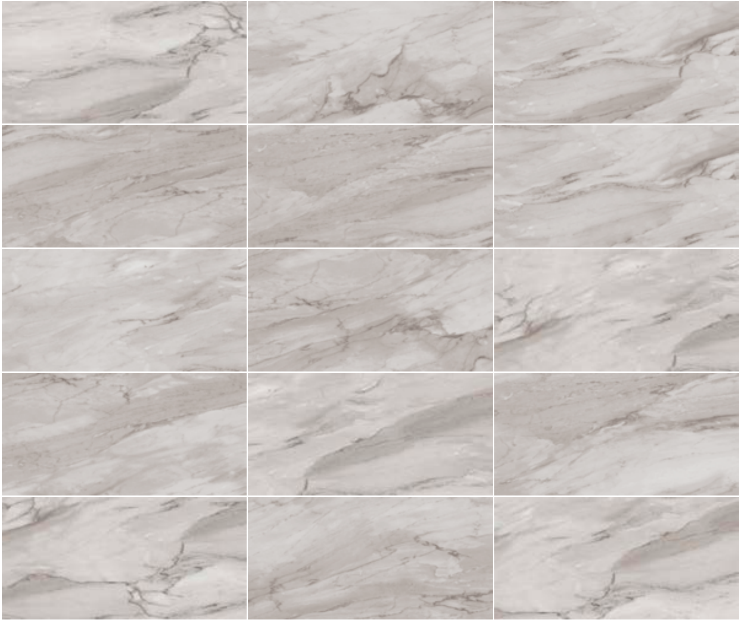
60X120/23,6"X47,2" GRAPHIC PROCESS