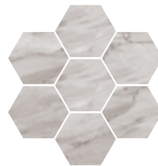
6000403 - ESAGONA 30X28/11,8"x11,1"