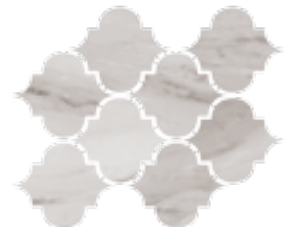
6000401 - TOLEDO 38,5X33/15,5"x13"