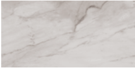
6000385 - 30x60/11,8"x23,6"