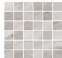
6000387 - MOSAICO (5X5) 30"x30"