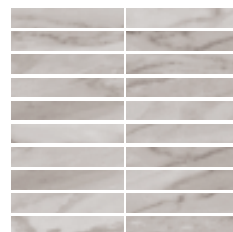
6000395 - MOSAICO (3X15) 30"x30"