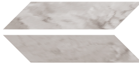
6000405 - CHEVRON 7,5X30/2,9"x11,8"