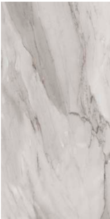
6000379 - 60x120/23,6"x47,2"