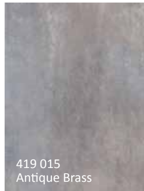
419 015 Antique Brass