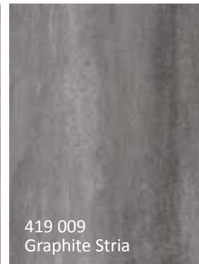
419 009 Graphite Stria