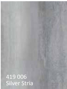
419 006 Silver Stria