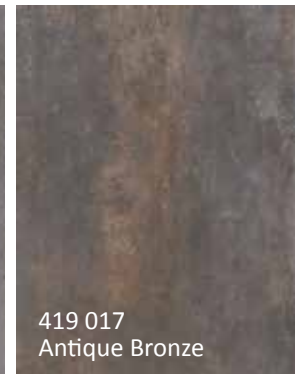
419 017 Antique Bronze