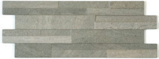
16 x 40 cm (6 x 16) Muretto Decor OL.ES.TPE.0616.MURDC