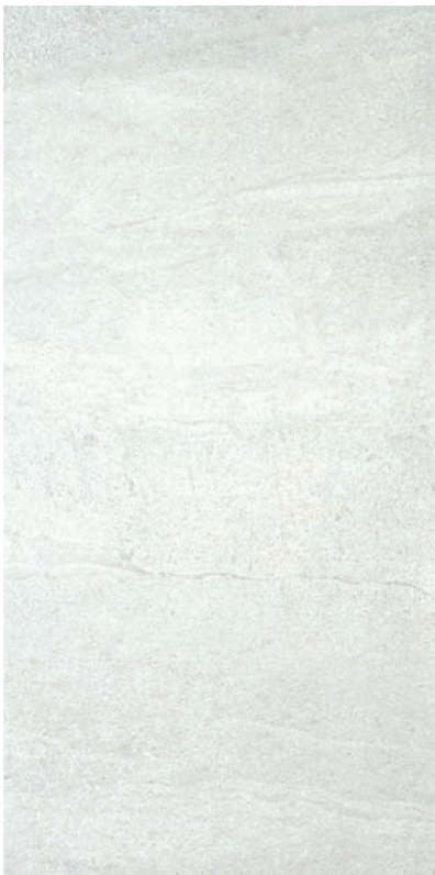
30 x 60 cm (12 x 24) OL.ES.BIA.1224.MT