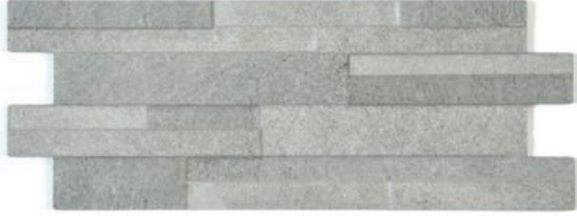
16 x 40 cm (6 x 16) Muretto Decor OL.ES.BIA.0616.MURDC