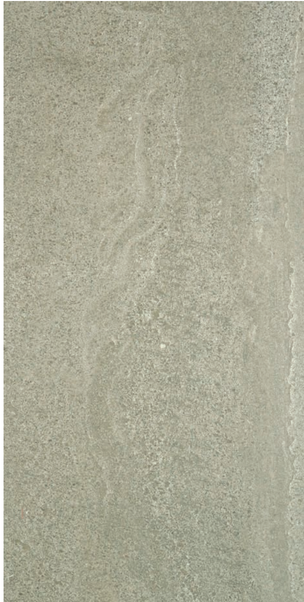
45 x 90 cm (18 x 36) (Rectified) OL.ES.TPE.1836.MT

All items shown in this document are part of Olympia's stocking program. For special orders, please contact your Olympia Tile Sales Representative.