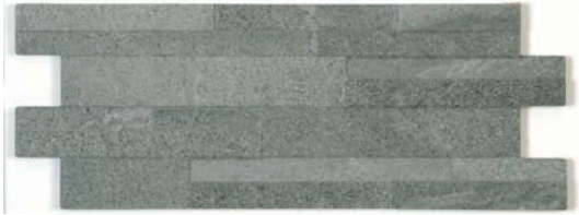
16 x 40 cm (6 x 16) Muretto Decor OL.ES.ANT.0616.MURDC