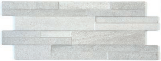
16 x 40 cm (6 x 16) Muretto Decor OL.ES.GRG.0616.MURDC