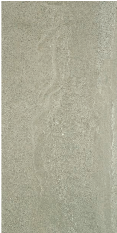
30 x 60 cm (12 x 24) OL.ES.TPE.1224.MT