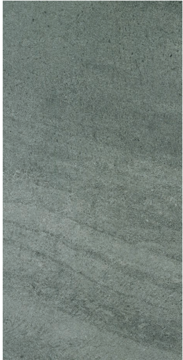
45 x 90 cm (18 x 36) (Rectified) OL.ES.ANT.1836.MT

All items shown in this document are part of Olympia's stocking program. For special orders, please contact your Olympia Tile Sales Representative.