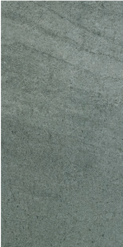
30 x 60 cm (12 x 24) OL.ES.ANT.1224.MT