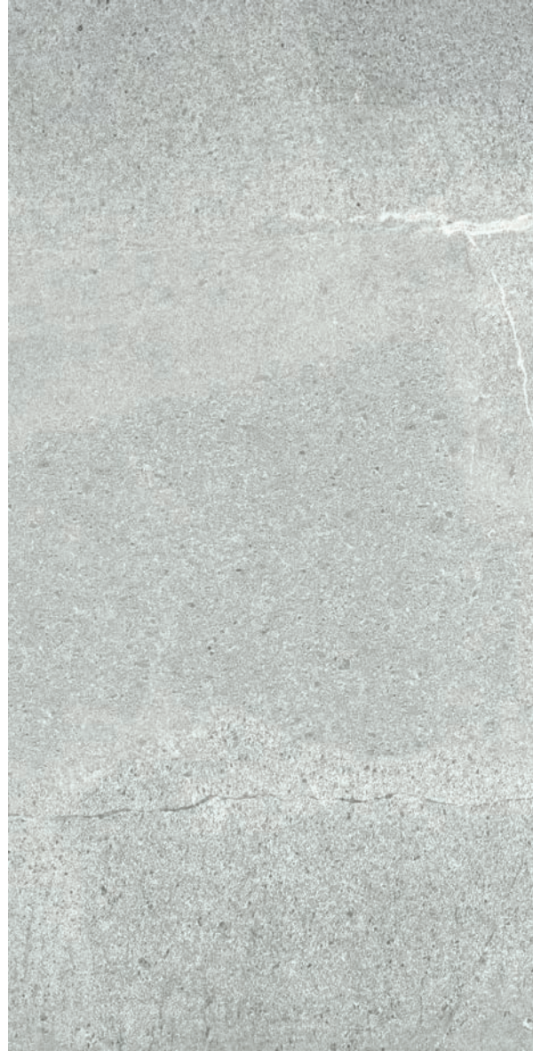
45 x 90 cm (18 x 36) (Rectified) OL.ES.GRG.1836.MT

All items shown in this document are part of Olympia's stocking program. For special orders, please contact your Olympia Tile Sales Representative.