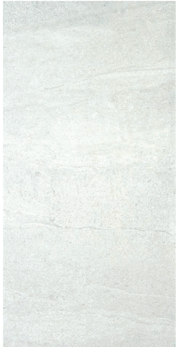
45 x 90 cm (18 x 36) (Rectified) OL.ES.BIA.1836.MT

All items shown in this document are part of Olympia's stocking program. For special orders, please contact your Olympia Tile Sales Representative.