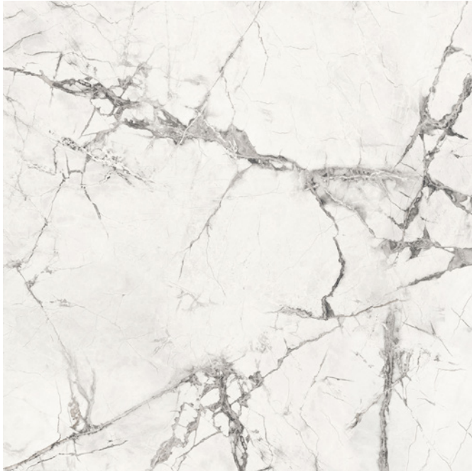
60 x 60 cm (24" x 24") Polished SO.PM.SPW.2424.PL

All items shown in this document are part of Olympia's stocking program. For special orders, please contact your Olympia Tile Sales Representative.