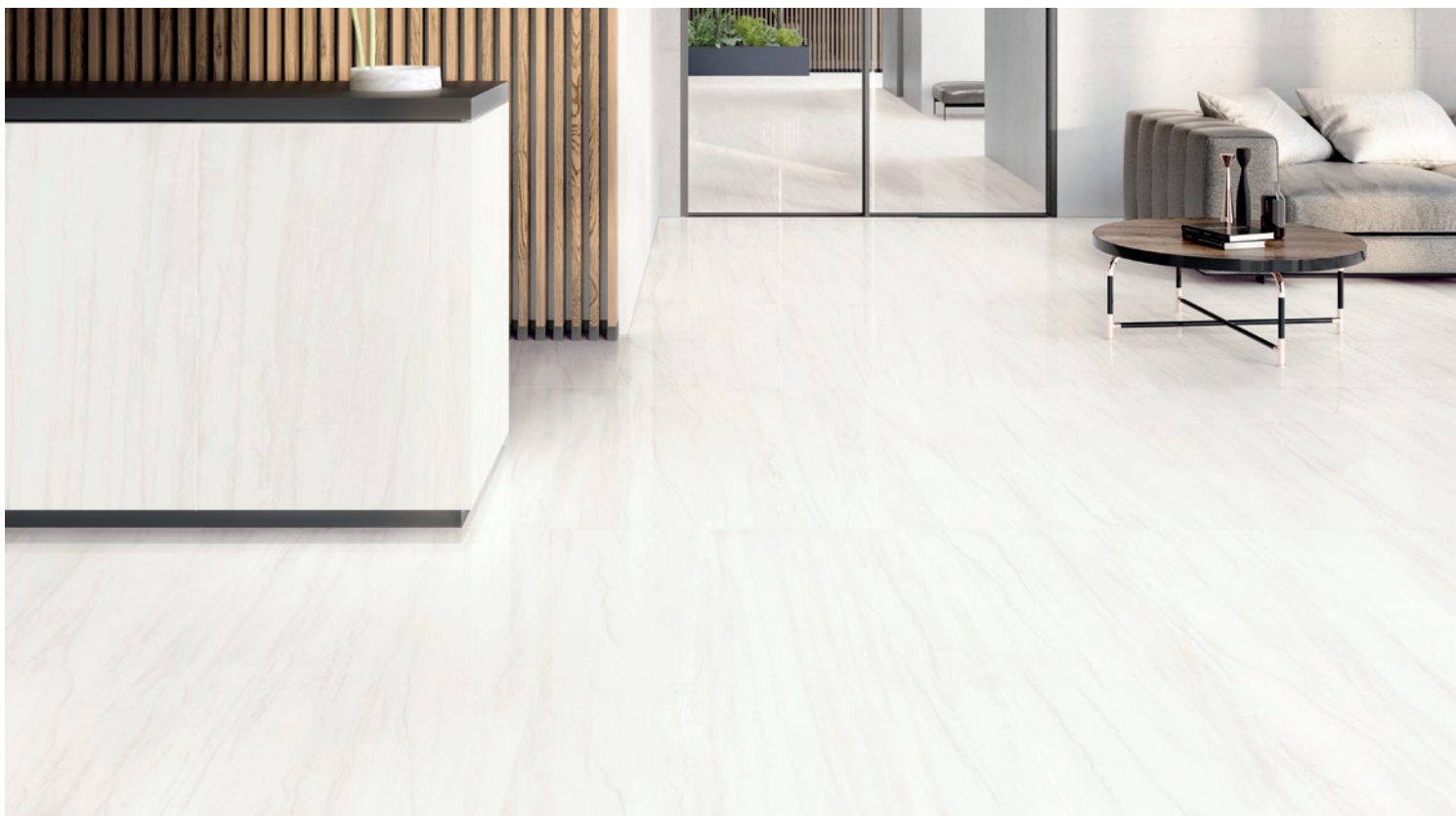
COVELANO WHITE (White)