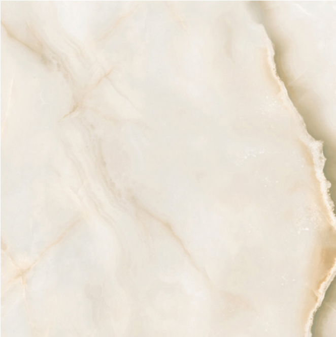
60 x 60 cm (24" x 24") Polished SO.PM.ONW.2424.PL