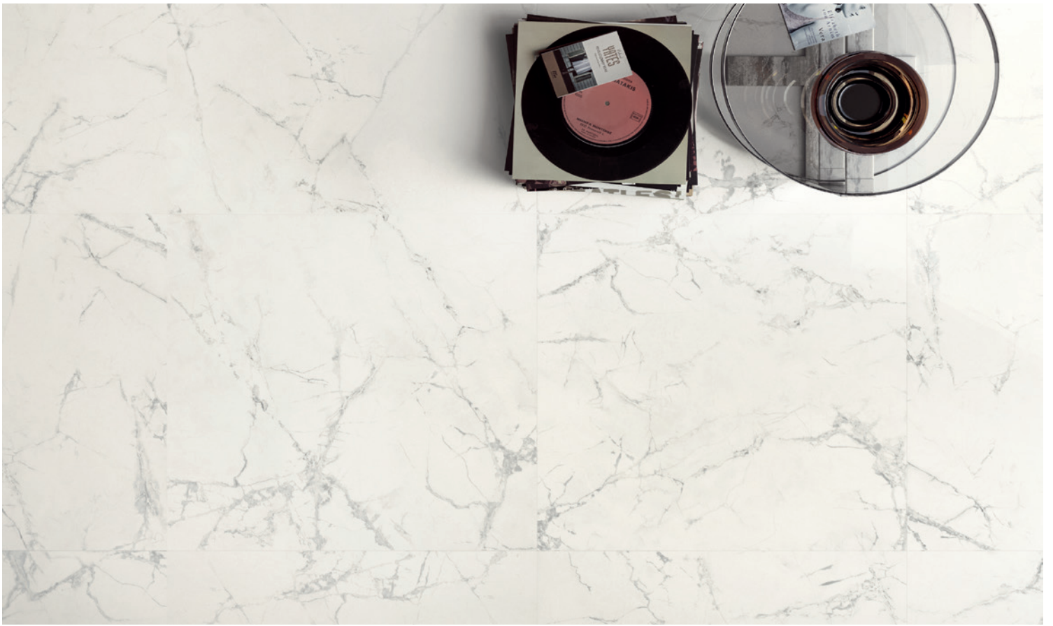
SPIDER WHITE (White/Dark Grey)