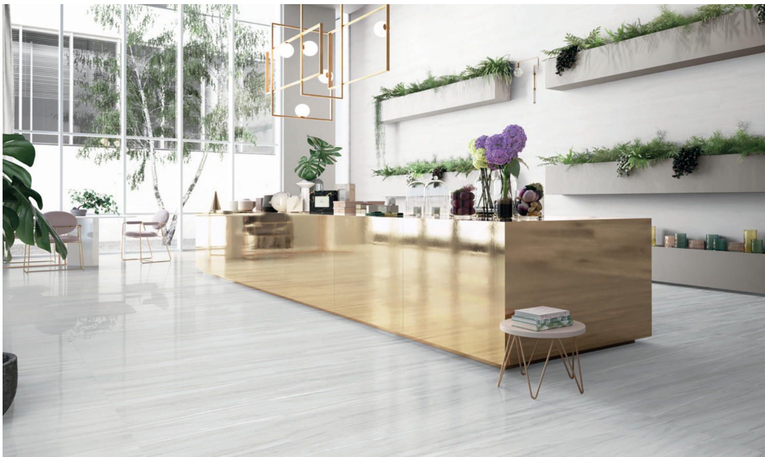
PALISANDRO SKY (Blue/Grey)