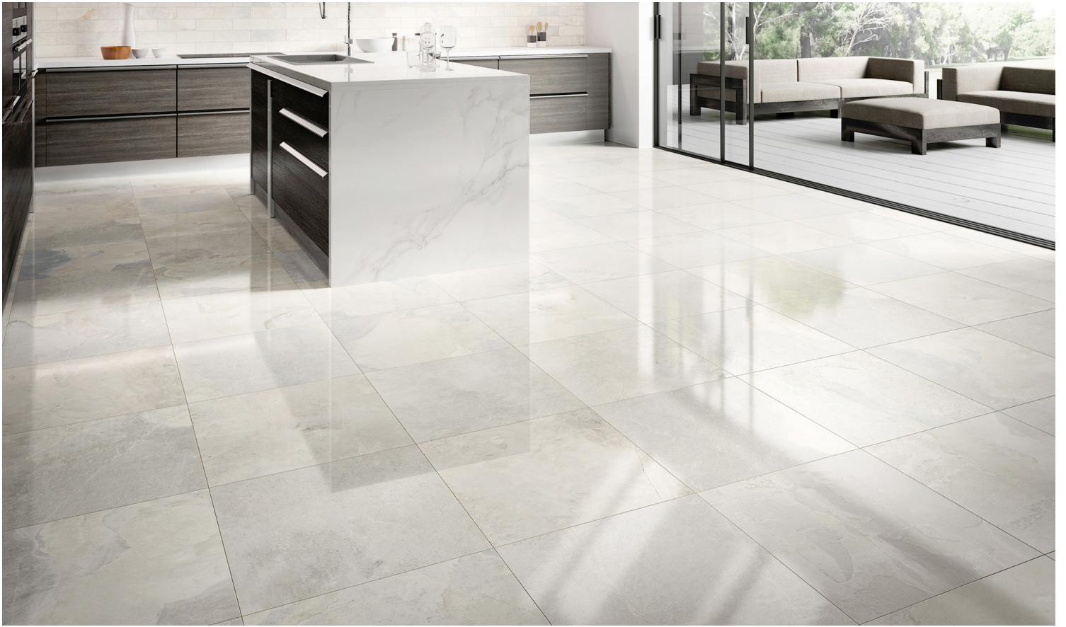
BROADWAY (Off White)