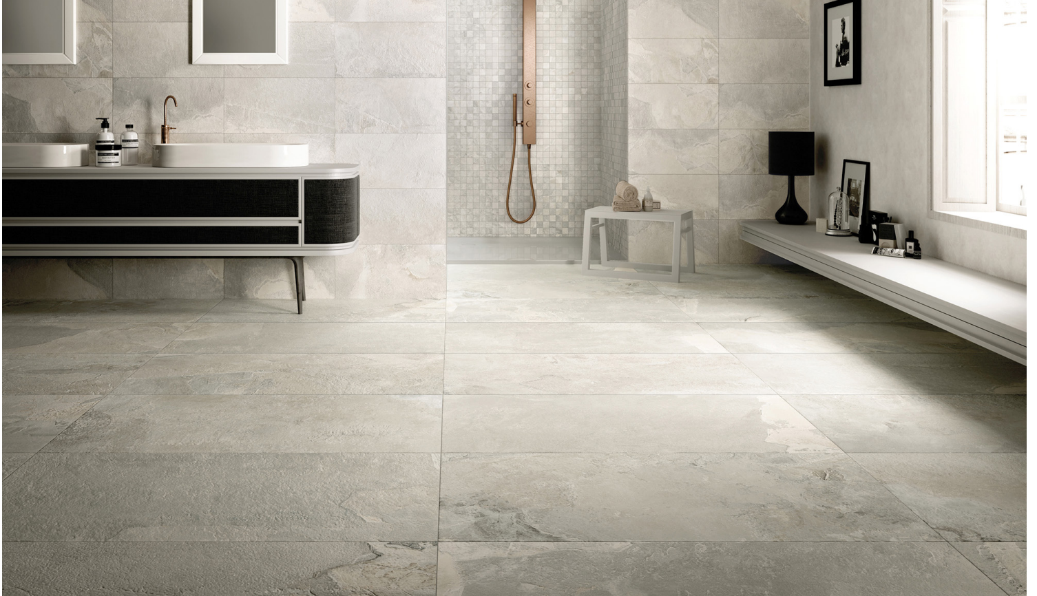
CHELSEA (Light Grey)