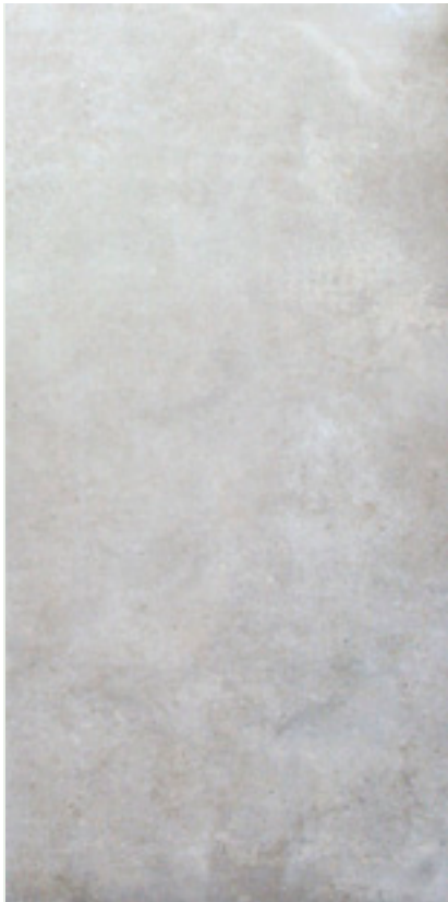
30x60.4 cm (11.81"x23.78") Matte Finish OL.AI.FNG.1224