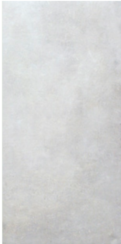
30x60.4 cm (11.81"x23.78") Matte Finish OL.AI.FUM.1224