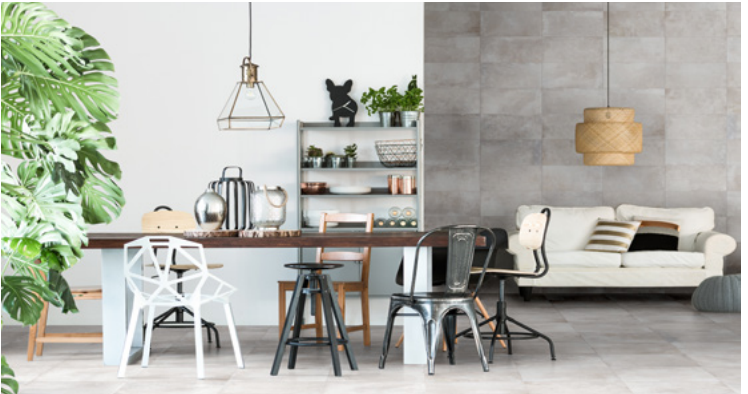
FUMO (Light Grey)