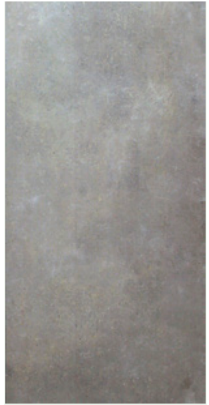
30x60.4 cm (11.81"x23.78") Matte Finish OL.AI.GFT.1224

All items shown in this document are part of Olympia's stocking program. For special orders, please contact your Olympia Tile Sales Representative.