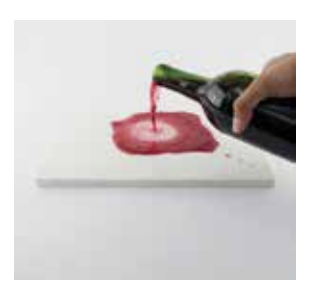
Wine Stain Test