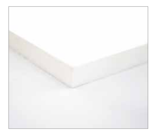
Stain Resistance Test

Size Available: 0.5" Thick 12x24, 24x24 Field, 2cm (0.75") Slab, 3cm (1.25") Slab