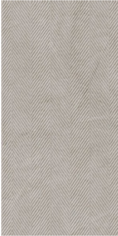
< LIGHT (Light Grey) 30x60 cm (11.81"x23.622") Matte Finish MC.AK.LHT.1224.DC