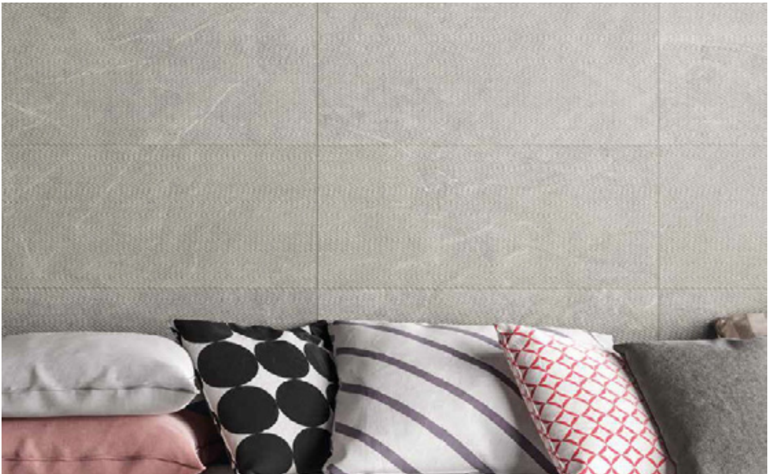
LIGHT (Light Grey) Decor