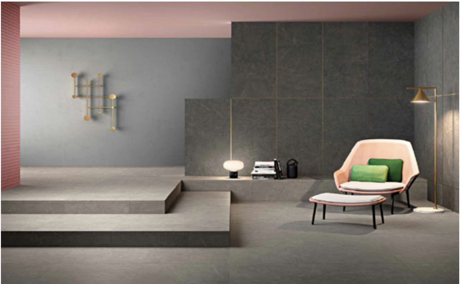
DARK (Dark Grey)