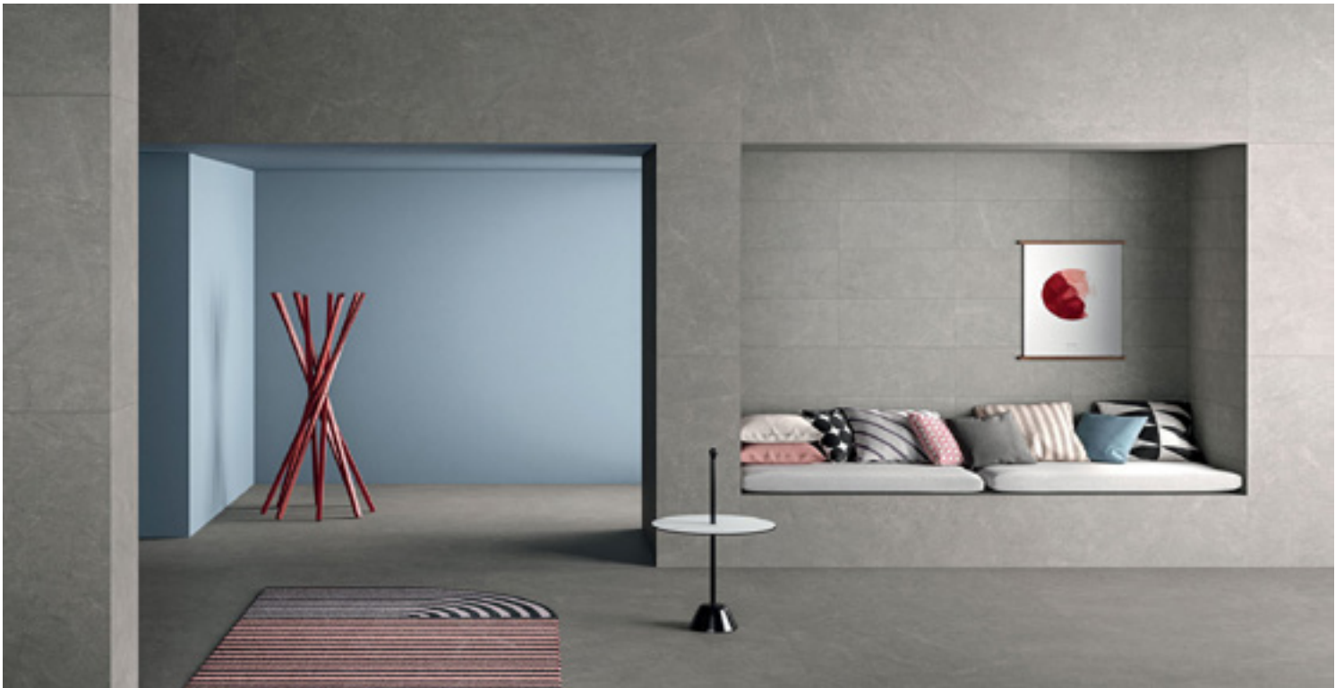
LIGHT (Light Grey)