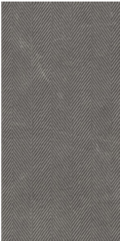
< SILVER 30x60 cm (11.81"x23.622") Matte Finish MC.AK.SIL.1224.DC