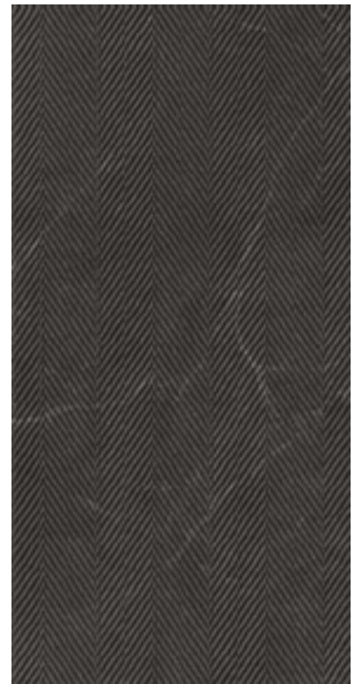
DARK (Dark Grey) > 30x60 cm (11.81"x23.622") Matte Finish MC.AK.DRK.1224.DC

All items shown in this document are part of Olympia's stocking program. For special orders, please contact your Olympia Tile Sales Representative.