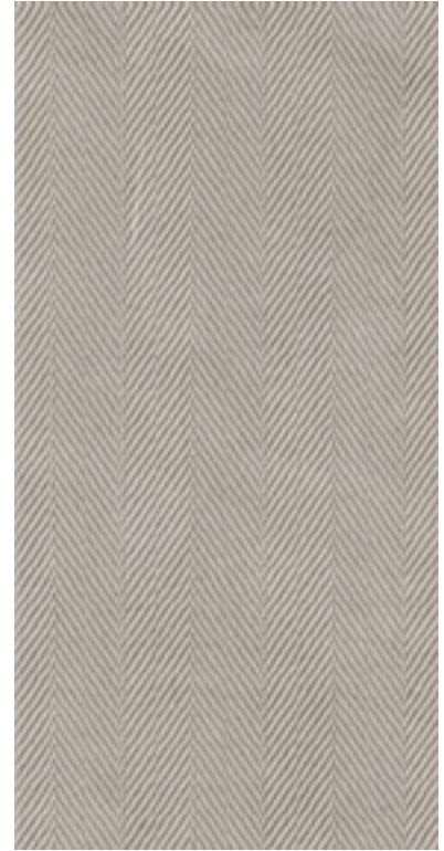
GRIEGE > 30x60 cm (11.81"x23.622") Matte Finish MC.AK.GRE.1224.DC